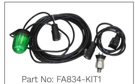
Part No: FA834-KIT1